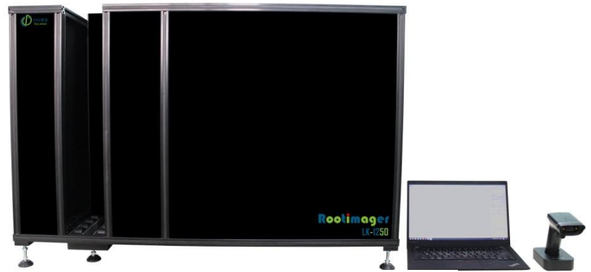
Fig.1 LK-1250 Plant Rhizo-box Imaging System

LK-1250 Plant Rhizo-box Imaging System is designed for long-term continuous noninvasive measurement of plant roots under controlled conditions. Plants are planted in a rhizo-box with transparent bottom which is obliquely placed on a bracket with a fixed angle. The roots are mainly distributed on the box panel due to gravity. Combined with professional root box imaging